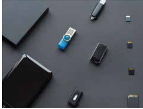
3C Products | Consumer Electronics 3C