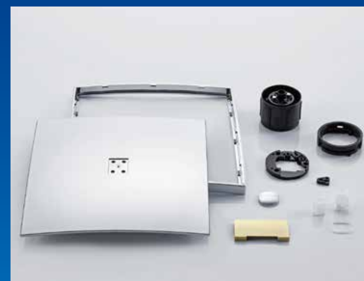
Precision Plastic Injection