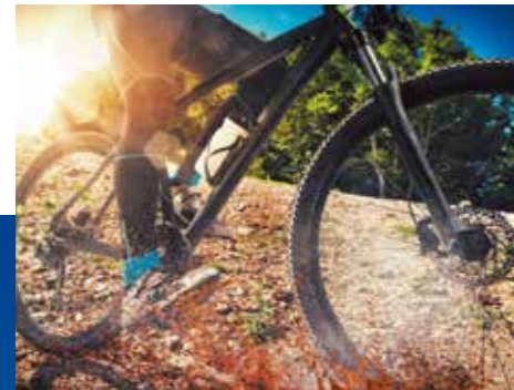
Transportation | Bicycle