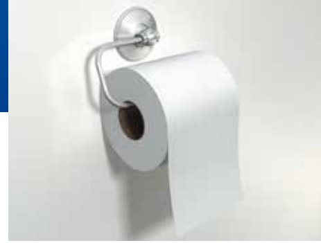
Bathroom | Bathroom Accessories