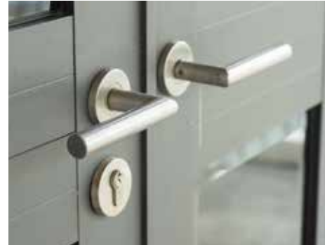
Building Material Hardware | Door Handles