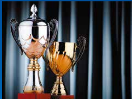
Gift | Medal, Trophy, Gift Hardware