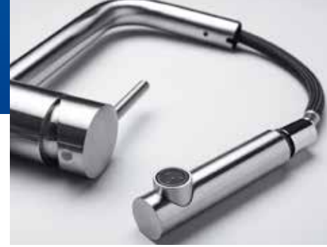
Bathroom | Plumbing Supplies

Tung Jui Yih has more than 30 years of experience in CNC precision machining and die-casting of zinc and aluminum alloys, and we have the experience and equipment to meet your needs in terms of structure and appearance of products. From bathroom hardware, kitchen hardware, building materials hardware, consumer electronic parts, bicycle parts, auto/scooter parts, tool hardware, marine hardware, gift hardware and diving equipment parts, Tung Jui Yih has a wide range of products that can be applied in the manufacturing process.