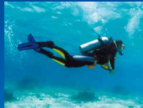
Leisure | Diving Equipment