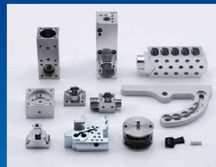
CNC Milling Machine Parts