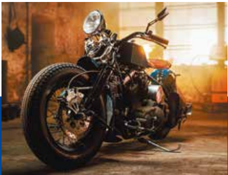
Transportation | Heavy-duty Motorcycles