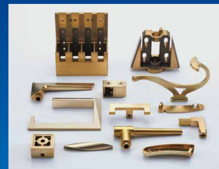
Forging / Casting Parts