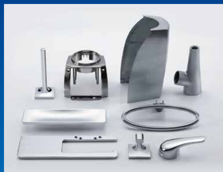
Zinc / Aluminum Alloy Die Casting Parts