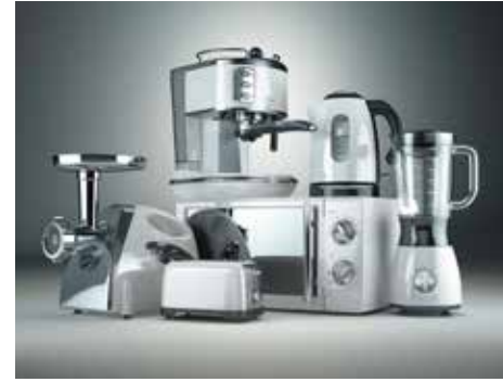
Kitchen | Home Appliances