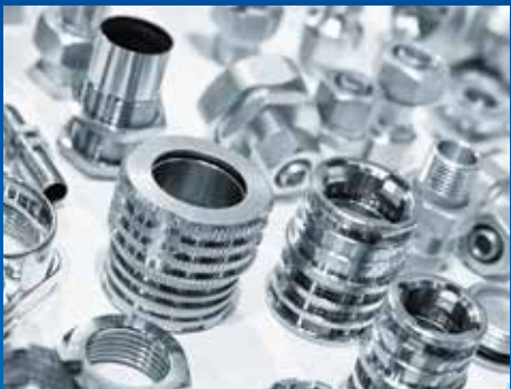
Parts Processing | Tool Hardware, Marine Hardware