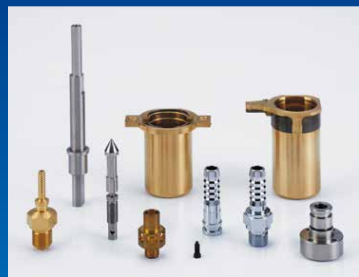
CNC Lathe Parts