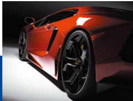
Transportation | Automobiles