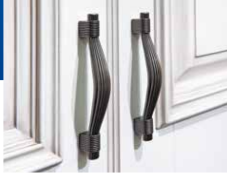
Kitchen | Drawer Handle